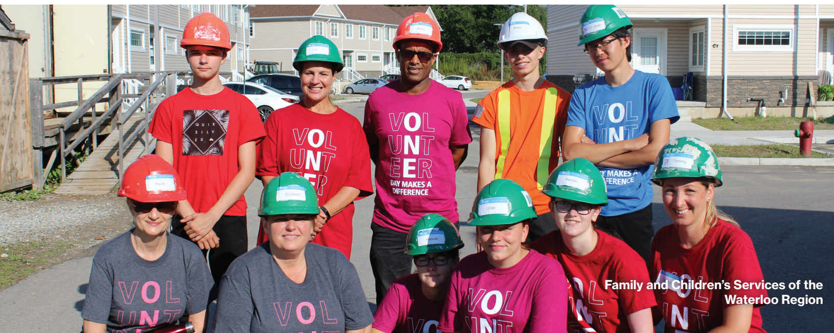
Family and Children's Services of the Waterloo Region